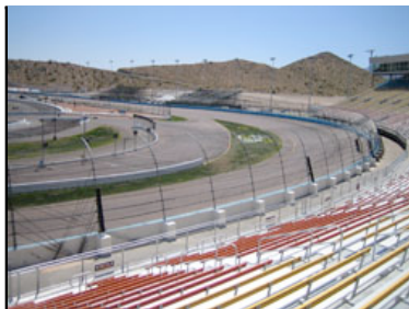
The SLS LS6593 are line array columns mounted directly on the track fences, angled up at the bleachers at the Phoenix International Speedway. There are 11 arrays spaced about 140 feet apart.

They decided to go with SLS's newly developed LS6593, based on their throw and wide bandwidth. The LS6593 models are line array columns designed to stack and the speedway owners wanted to mount them directly on the track fences, angled up at the bleachers, so they enlisted the expertise of local contractor Sound Image to put the system together.